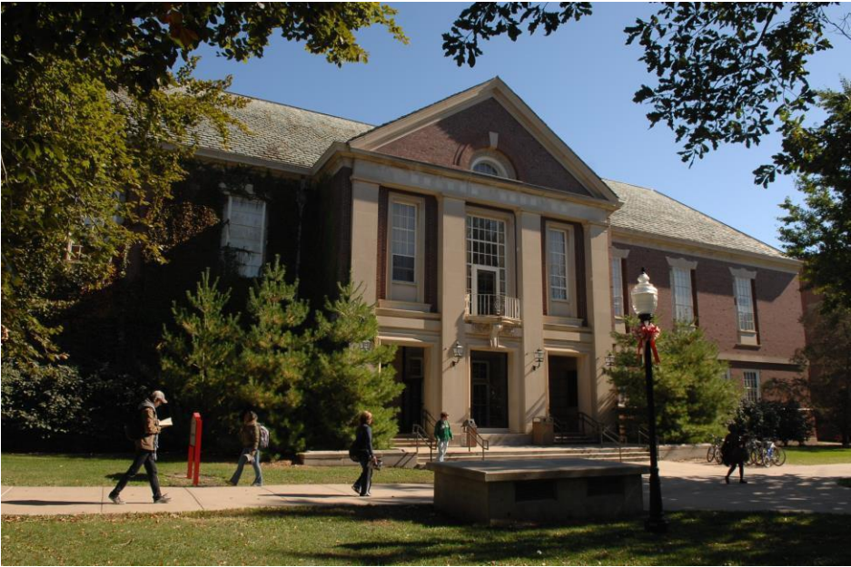
Illinois State University – Williams Hall Home of Management Development International